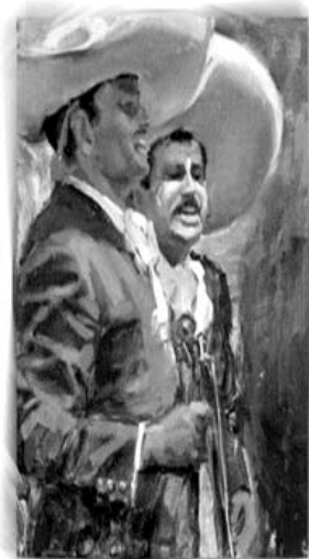
Painting by: Theda Rhea

For more information, call 303.534.8342 or visit www.newsed.org