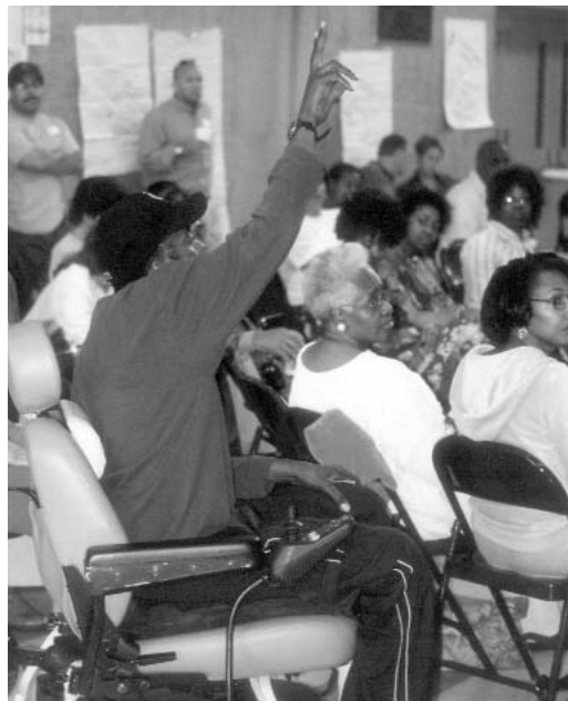
A neighborhood member raises his hand to comment at a Manual Renewal Process community meeting. Four general community meetings and dozens of "community conversations" guided the Community Council's efforts.

In February 2006, the Denver Public Schools (DPS) Board voted to temporarily close Manual High School for a year because of low academic performance, declining enrollment, and high attrition. At the same time, they voted to re-open in 2007 with a 9th grade class only and add a grade-level each subsequent year. With that goal in mind, a Renewal Team was appointed to support the community